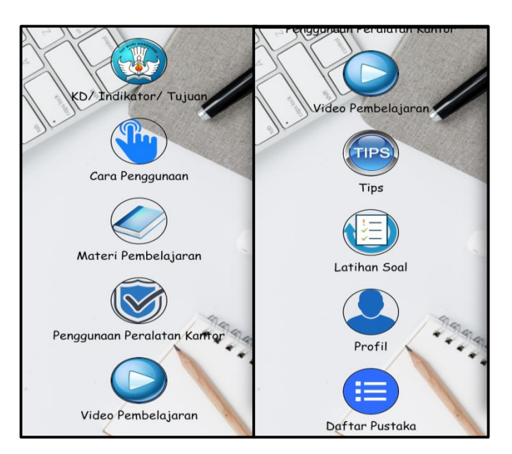
Figure 1. Instructional Media Menu

Instructional media mobile learning based android in office tools has been created using online builder Appypie based on DCE steps. The media creation intends to increase the students' outcomes These are steps conducted by researcher to create instructional media using DCE method. The first step is Design. After obtaining learning tools such as syllabus from Public Administration teachers, the next step is to analyse syllabus. From the syllabus, it is clear to know what should be prepared including the materials and exercises in the form of 15 multiple choices and 10 essays to use in instructional media. It is important to give exercises as a student skill evaluation mastering material. The evaluation should be balance and meaningful based on contained learning material (Parsazadeh et al., 2018). In this step, there is storyboard to divide prepared material into sub-material to be an icon in instructional media. The instructional media menu can be looked at this figure.