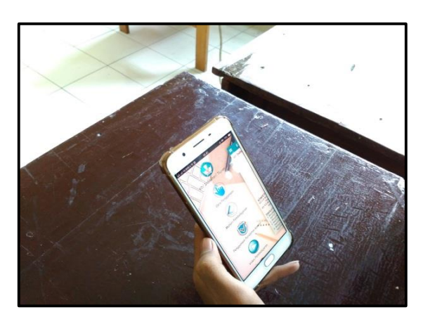
Figure 3. The use of instructional media

The Figure 2 shows that the developed instructional media mobile learning based android has been feasible to apply in the learning activities. Material and media experts convey that this instructional media attract students in the easiness to operate. From students' perspective, the instructional media mobile learning increase the effectiveness and efficient of learning, to boost the students' spirit and to help understanding learning materials (Jeno et al., 2017). These are the pictures of instructional media: